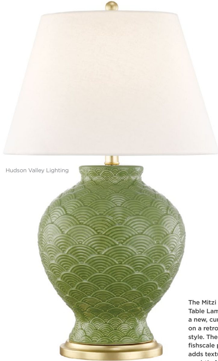
Hudson Valley Lighting

Geometric patterns have been somewhat of a trend these past few years, especially with crisp architectural lines that feel bold and modern. A shift is coming to softer, more feminine lines with lots of curve.