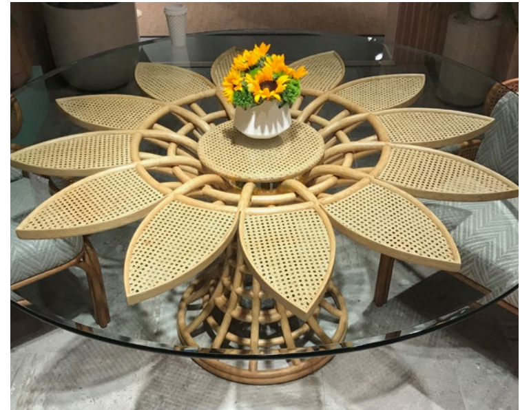
The McGuire Company