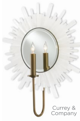
Currey & Company