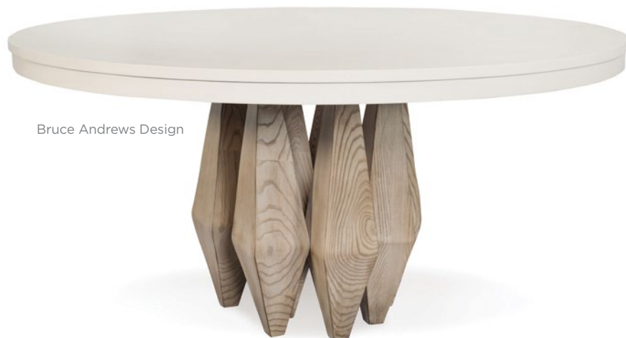
Bruce Andrews Design