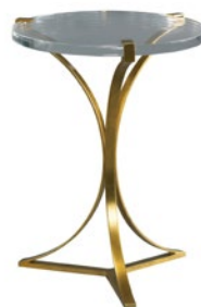
Lillian August for Hickory White