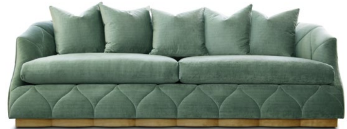
Nathan Anthony Furniture