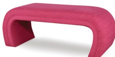
Highland House Furniture