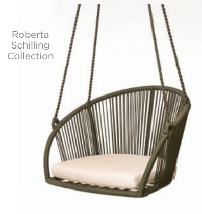
Roberta Schilling Collection