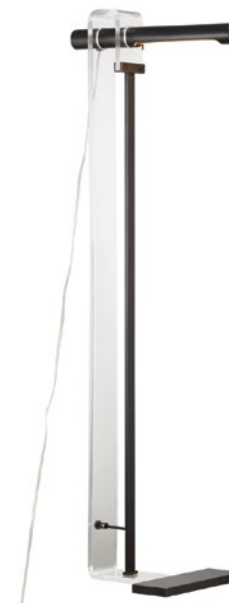
Hudson Valley Lighting