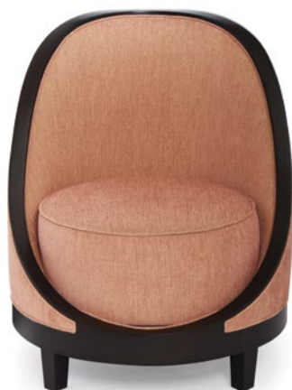
Badgley Mischka Home