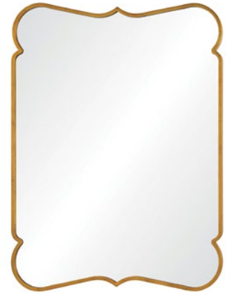
Mirror Image Home

Barclay Butera created the perfect marriage between feminine and masculine in the contours of the heavy iron material of his Distressed Gold Mirror for Mirror Image.