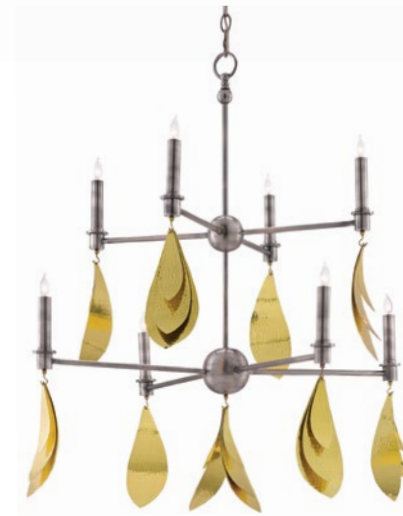
Currey & Company