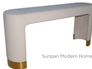
Sunpan Modern Home

A nod to French Deco or a nod to the Eighties? I can't be quite sure of the intent, but what I know for sure is there was a prevalence of carefully crafted pieces, modern curves and architecturally inspired angular forms and arches at Spring Market. Art Deco is certainly not a new trend, but its current renaissance is modern, yet timeless. It includes simple and sculptural forms, exaggerated scales, beautifully upholstered pieces, and subtly gilded finishes that add just enough drama and contrast. Sculpted table pedestals, round back chairs, plush fabrics, and abstract art-inspired pieces abound at Market.